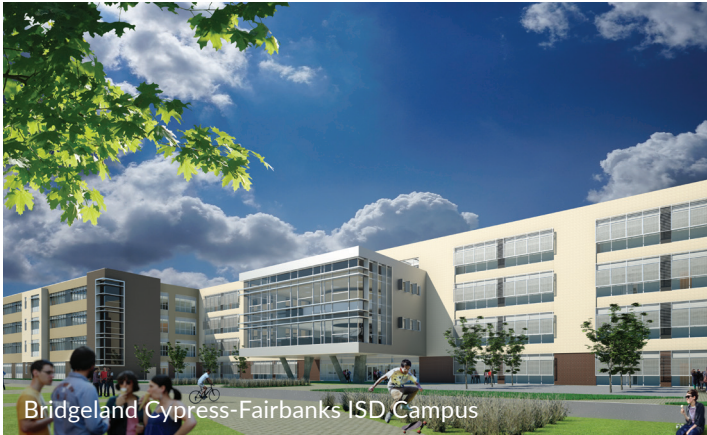
Bridgeland Cypress-Fairbanks ISD Campus