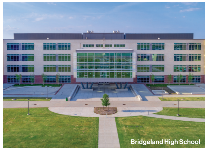
Bridgeland High School