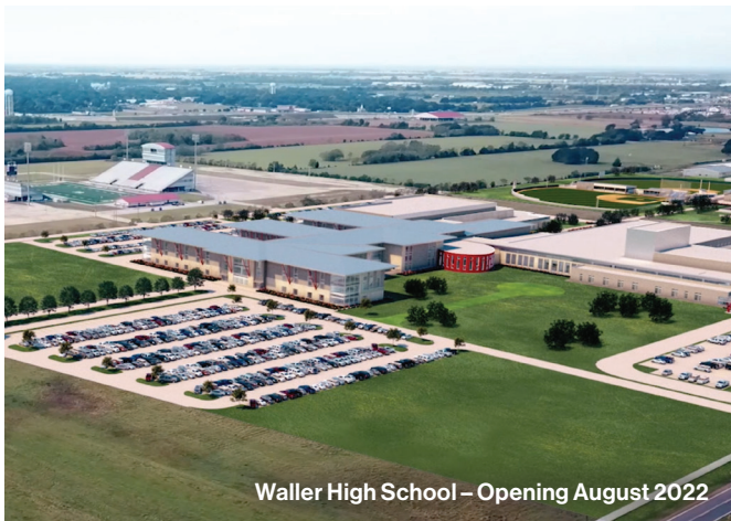
Waller High School – Opening August 2022

ONE OF THE TOP-RATED SCHOOL DISTRICTS IN THE STATE, WALLER ISD EARNED AN “A” RATING OVERALL FROM THE TEXAS EDUCATION AGENCY IN THE LATEST STATEWIDE RATINGS