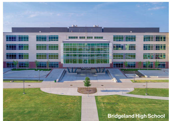
Bridgeland High School