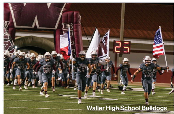
Waller High School Bulldogs