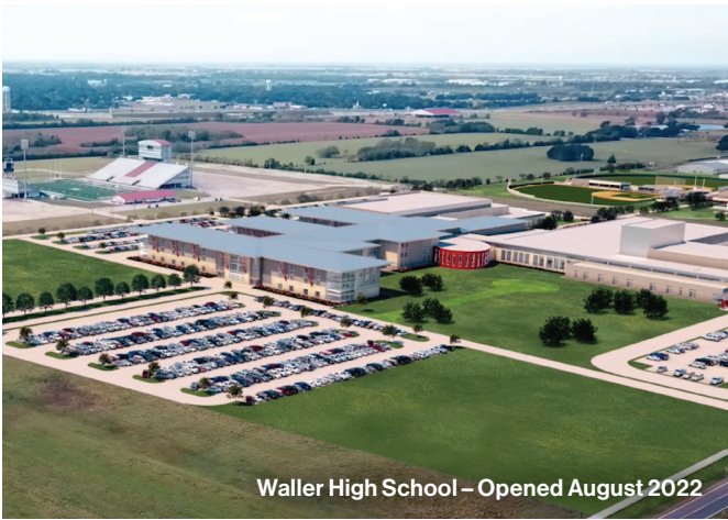
Waller High School – Opened August 2022

ONE OF THE TOP-RATED SCHOOL DISTRICTS IN THE STATE, WALLER ISD EARNED A “B” RATING OVERALL FROM THE TEXAS EDUCATION AGENCY IN THE LATEST STATEWIDE RATINGS