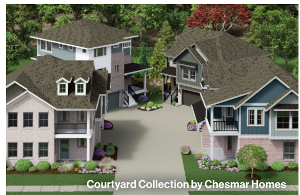
Courtyard Collection by Chesmar Homes

For more information, visit Bridgeland.com/ParklandVillage .