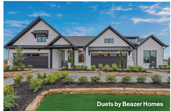
Duets by Beazer Homes

Bringing an urban feel to the new neighborhood in Parkland Village, Chesmar Homes introduces the Courtyard Collection, a new architectural style and homesite layout for Bridgeland. These homes will feature Modern Farmhouse exteriors along with elements of Prairie-style architecture. Floor plans will be bright and open with abundant windows, tall ceilings and flowing living areas, both indoor and out. Additionally, the new collection features a sociable entry courtyard drive with decorative pavers.