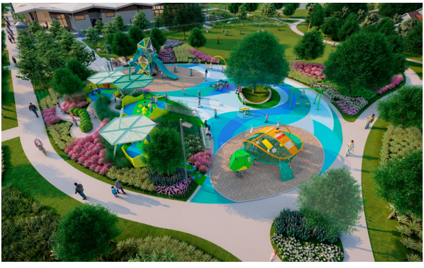
Creekland Amenity Center - Opening 2025

Nestled along Cypress Creek, Creekland Village is Bridgeland's exciting new addition where you and your family can experience the outdoors. Here, live in harmony with natural surroundings and the wonder of nature around every corner. With 3,000 homesites to choose from, you can enjoy easy access to walking trails, parks and ample outdoor spaces. At Creekland, located just west of Grand Parkway, you'll have access to all of Bridgeland's current amenities and a variety of new amenities that will be built in Creekland. In fact, 54% of Creekland is dedicated to greenspace, parks and trails.