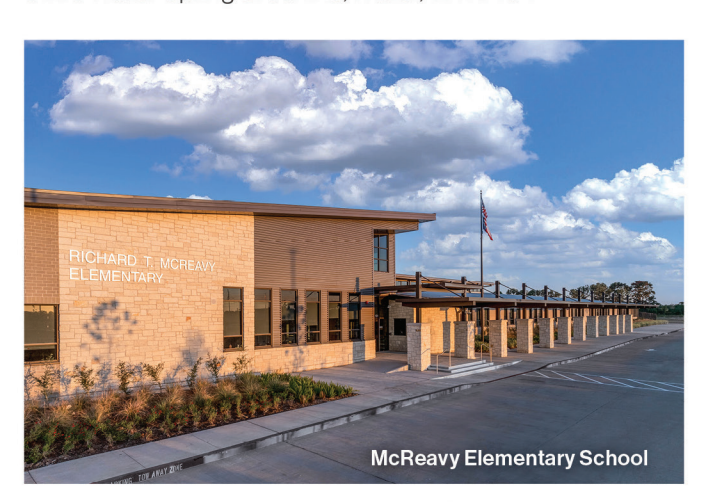
McReavy Elementary School opened in Bridgeland in August 2024.

31213 Waller Spring Creek Rd, Waller, TX 77484